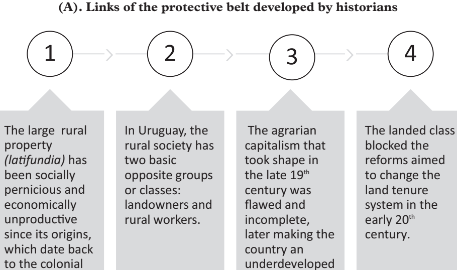
DIAGRAM 1 (A). Links of the protective belt developed by historians