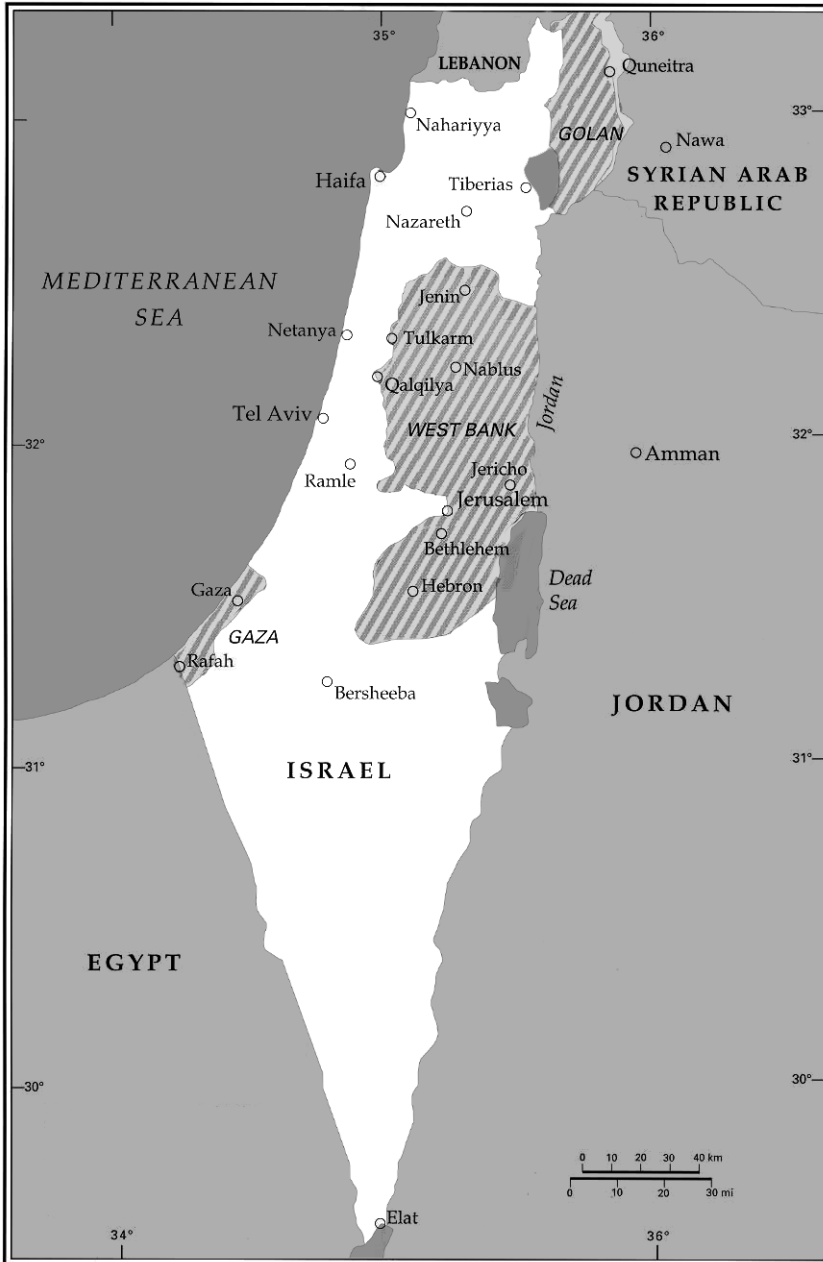
MAP 1 Israel and the Occupied Territories

Source: Based on UN map, UNISPAL ( http://unispal.un.org/unispal.nsf ).